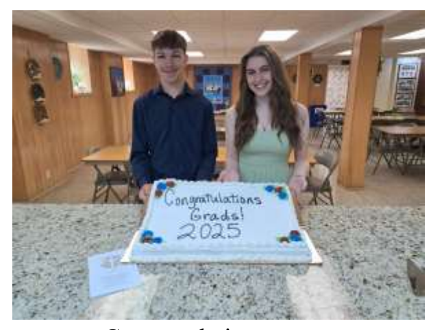
Congratulations to our 2025 Graduates!

If you need to speak to a council member please call the church office to leave a message and they will return your call.